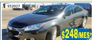
15 CHEVY MALIBU AUTO, T/ELEC, CD, ALLOYS, #B3527