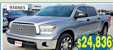
12 TOYOTA TUNDRA 4.6L AUTO, T/ELEC, CD, ESTRIBOS, ALLOYS, CREW MAX, #5DC4210A