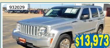
11 JEEP LIBERTY SPORT AUTO, T/ELEC, CD, ALLOYS, #5DR3588A