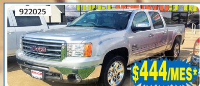
13 GMC SIERRA 1500 TEXAS EDITION AUTO, T/ELEC., CD, ESTRIBOS, CROMO, #SB0333