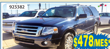
14 FORD EXPEDITION AUTO, T/ELEC., 3RA FILA, CD, ESTRIBOS, ALLOYS, #5B0230