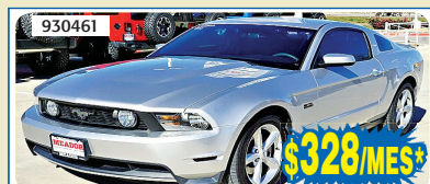
12 FORD MUSTANG GT 5.0L AUTO, T/ELEC, CD, ALLOYS, #5G4008A