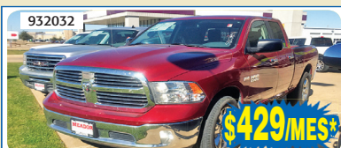
14 RAM 1500 AUTO, T/ELEC, CD, ALLOYS, #SB0389