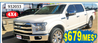
15 FORD F-150 LARIAT AUTO, T/ELEC, CD, QUEMAC, PIEL, SIS/NAV, ESTRIBOS, CROMO, #6WW1083A