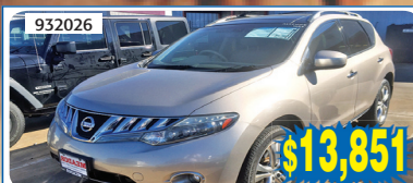
10 NISSAN ROGUE AUTO, T/ELEC, CD, QUEMAC, ALLOYS, #6WW553A