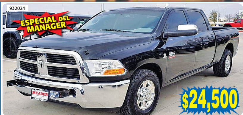
12 RAM 3500 HD AUTO, T/ELEC, CD, ALLOYS, CREW CAB, #6WW1136A