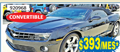
11 CHEVY CAMARO SS AUTO, T/ELEC., CD, PIEL, ALLOYS, #5DR3927A