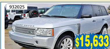
07 LAND ROVER RANGE ROVER HSE AUTO, T/ELEC, CD, PIEL, ALLOYS, #6WW630A