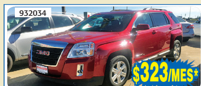
15 GMC TERRAIN AUTO, T/ELEC, CD, ALLOYS, #SB042