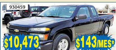
08 CHEVY COLORADO AUTO, T/ELEC, CD, ALLOYS, EXT. CAB, #5RG3410A