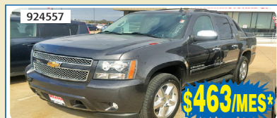
14 CHEVY AVALANCHE AUTO, T/ELEC., CD, PIEL, ESTRIBOS, ALLOYS, #SB0383