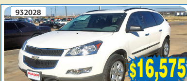
12 CHEVY TRAVERSE LS AUTO, T/ELEC, CD, ALLOYS, #6GV752A