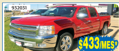
13 CHEVY SILVERADO 1500 TEXAS EDITION AUTO, T/ELEC, CD, ALLOYS, #SB0403